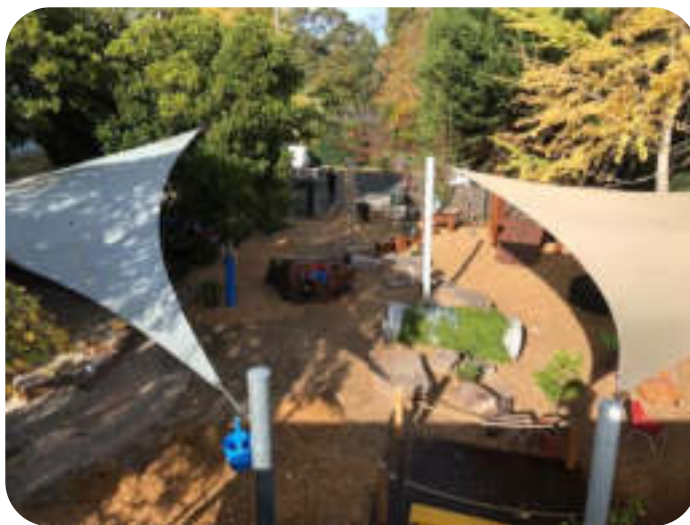
Tecoma Preschool 2019!

Places at Tecoma Preschool fill fast, so if you have any siblings or know of friends or family that would like to attend in the future, be sure to complete an enrolment application