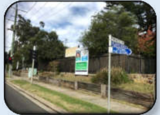
Front tidy up

No doubt our children and educators will have a spring in their step walking into a smart and tidy environment, which is our main objective.