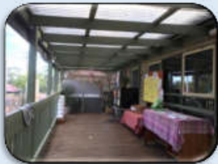
Decking high pressure cleaned, including roof