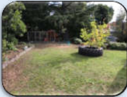
Front garden tidy

Firstly, I wanted to thank all those families that attended our working bee on Saturday 19 th May. The results speak for themselves, with the Pre-School looking especially smart and tidy...all the way from the carpark entrance right through to the nature strip on Burwood Highway. There was hardly a rock unturned!