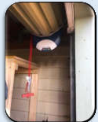
Garage door remote motor installed