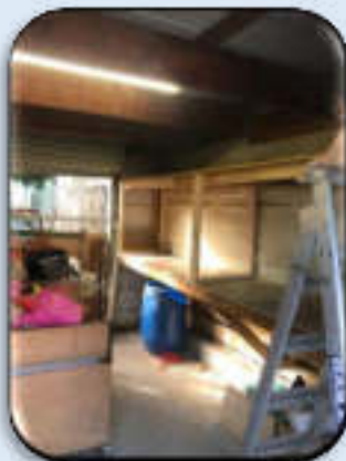
Shed shelf installed