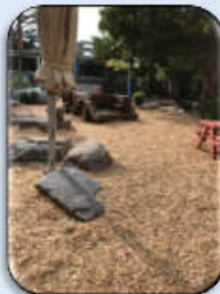
3m 3 of soft fall tan bark spread