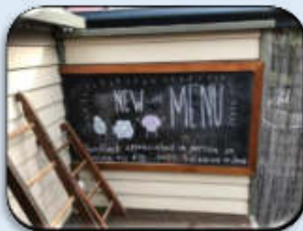
Chalk board installed